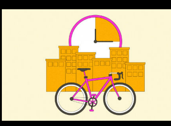
How '15-minute cities' could save time, reduce emissions, and build community

Carlos Moreno, pioneer of the 15-minute city concept, envisions neighborhoods where basic needs, work, and social activities are accessible within a short walk or bike ride from home. This model, exemplified by Paris' reduction of traffic and pollution, enhances local social cohesion and environmental sustainability, exploring urban fragmentation and promoting community-centered, sustainable planning. By enhancing community resilience, reducing environmental impact, and promoting equitable access to resources, the '15-minute city' model ultimately promotes more inclusive, accessible, and harmonious societies.