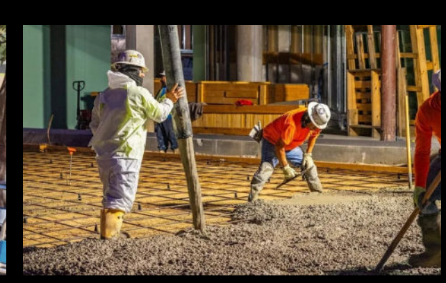
A former Utah coal town could soon become a hub for low-carbon cement

Terra CO2 Technology plans to establish a lowcarbon cement facility in Magna, Utah, repurposing mine waste from the Kennecott copper mine to reduce cement's carbon footprint. With a $52.6 million Department of Energy grant, the company will produce supplementary cementitious materials (SCMs) as an alternative to Portland cement traditionally used in concrete. The industry today generates 8% of human-driven CO2 emissions globally, but with SCMs, they can emit 70% less CO2 than the industry standard, using silicate rocks to produce an end-product that is already costcompetitive. This effort, alongside other DOEsupported projects, aims to reduce emissions in coal-dependent communities by historically promoting sustainable industrial innovation. Together with the other 14 projects, they are expected to contribute to the creation of more than 1,900 new jobs in these communities.